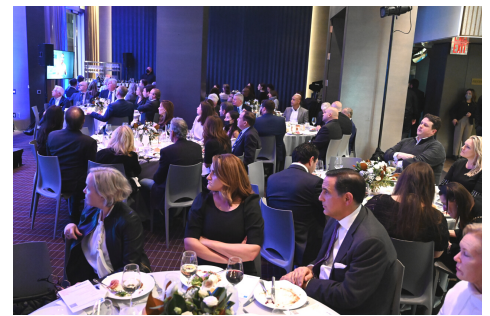
Attendees viewing a video presentation.