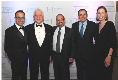
Members of the Executive Team with the 2021 Honorees.