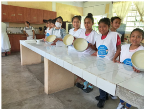
Girls from Cuilapa, Guatemala participating in a cooking workshop.

Lastly, the Village began offering free, weekly beginner's ESL courses to the local community. If you are interested in volunteering with any of these programs, contact The Village at 718-749-0909.