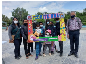
Children from Bolivia participating in a conference on children's rights.