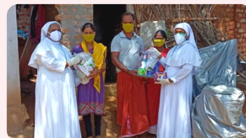
Staff of Maria Goretti in Kerala, distribute food to families of girls who are unable to attend the program.

At the same time, the lack of children at the programs was a perfect opportunity for our Partners to make improvements to the facilities and to create spaces for recreation. We look forward to the children's return, where they will find updated facilities and access to space for various sports and activities.